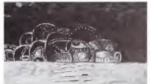
Philip Guston, Cabal , 1977

Rothenberg noted of the unfamiliar terrain they were exploring, "I am an image maker who is also an image breaker—trying for a little more." Following a series of paintings that used a horse as the major motif, Rothenberg increasingly offered what appear to be outlined dream fragments on monotone fields of paintstrokes. Philip Guston and, shortly thereafter, Jenney first introduced variations in painterly representation into their literary-minded paintings of the late 1960s. By the end of the 1960s, Jenney had surmised, "you cannot paint out the paint," and "useful spontaneity is planned." With his thick, sculptural frames and loosely painted images, he became a purveyor of cultural illusions and allusions. Guston's subjects and colors were nastier, expelled